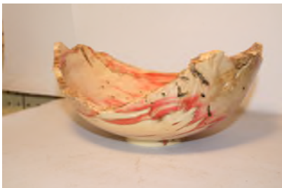
Wes Jones/Bob Black